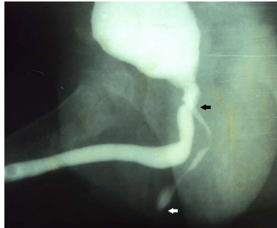
Fig. 2. Urethrocytogram shows the urethroperineal fistula tract originating from the prostatic urethra (black arrow) extending to the perineum (white arrow).

a circular skin incision was made around the orifice. Dissection around the fistula was performed on a length of 6 cm [Fig. 3]. The proximal stump of the fistula with approximately 8 mm of length, was ligated using a 3-0 polyglactin acid thread, when further mobilization was not possible.