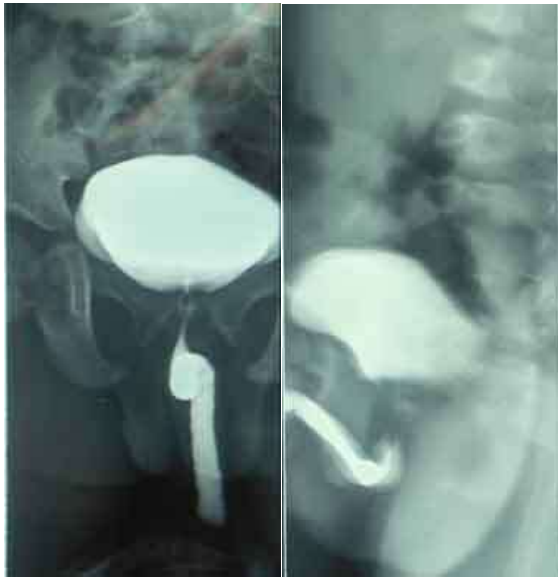
Fig. 4. Postoperative urethrocytogram without urethroperineal fistula tract visualized.

The patient reported no complaints or complications at his 4-month postoperative follow-up. Postoperative retrograde and voiding urethrocytograms were normal [Fig. 4].