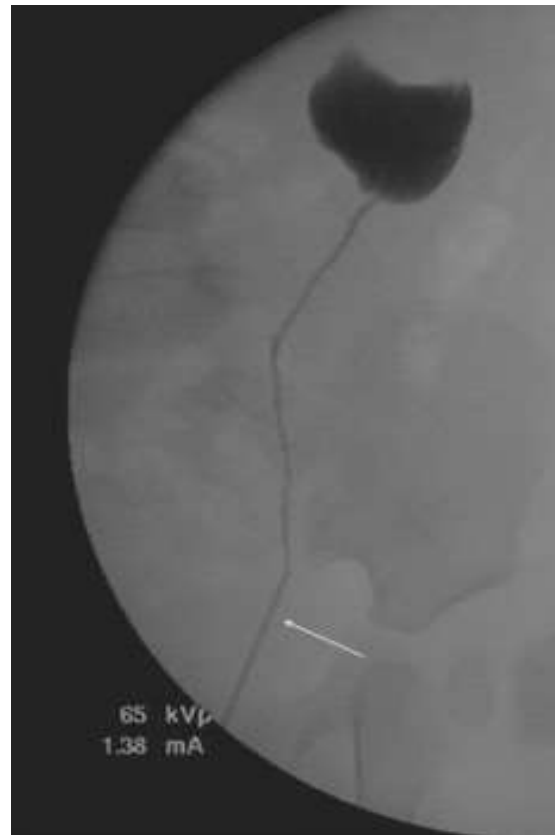
Fig. 2. Retrograde pyeloureterography. A 3Fr tube was inserted into left ureteral orifice (arrow) and injected a contrast medium. Severe stenosis of the entire ureter and dilation of the renal pelvis were observed.

First, cystoscopic retrograde pyeloureterography was conducted. When observing with a cystoscopy, the left ureteral orifice existed normally. It was difficult to insert a 3Fr tube into the left ureter, but barely inserted the tip of the tube into the ureteral orifice and injected a contrast medium. Severe stenosis of the entire ureter and dilation of the renal pelvis were observed [Fig. 2].