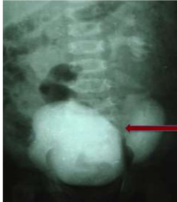
Fig. 1. IVP showing dilated ureter in the entire course (red arrow).

A 2-year-old male child presented with pain in abdomen and crying during micturition. There was no history of urinary tract infections. The general as well as systemic examination findings did not show any abnormality. Results of the blood, urine, and culture were negative. Abdominal ultrasound showed a normal right kidney and ureter, a hydronephrotic left kidney measuring 8.2 \times 3.1 \times 4.2 cm, hydroureter with uniform dilatation measuring 12 mm, and a normal bladder. The MCU was normal; there was no evidence of reflux; and intravenous pyelogram (IVP) showed mild hydronephrosis, massively dilated and tortuous left lower ureter, and moderate hydroureter in the mid and upper ureter [Fig. 1]. Diethylene-triamine-penta-acetic acid (DTPA) scan showed delayed excretion of dye on the left side with t_{1/2} more than 20 min. Dimercaptosuccinic acid (DMSA) scan showed reduced function on left side, the differential being 29.7%, and absence of scars. A diagnosis of left obstructed megaureter was made and the child was posted for elective surgery. Intraoperatively, the left ureter was mobilized extravasically to find a normal ureterovesical junction and a normal distal ureter up to 5 cm from the ureterovesical junction proximal to which ureter was dilated.