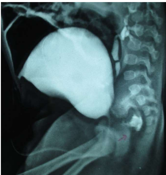
Fig. 2. VCUG showing bilateral vesicoureteric reflux with bladder diverticuli, good caliber normal dorsal urethra and dye going from urethra to rectum which suggested Y type urethral duplication.

X-ray abdomen showed faecal loading. Voiding cysto-urethrogram (VCUG) showed bilateral vesicoureteric reflux (VUR) with bladder diverticuli, good calibre normal dorsal urethra and dye going from urethra to rectum which suggested Y type urethral duplication [Fig. 2].