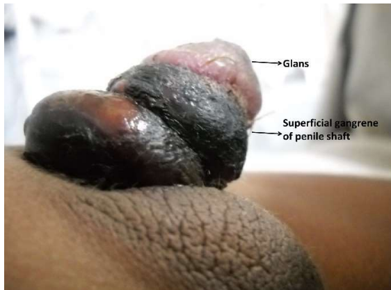
Fig. 1. Superficial gangrene of penis from hair tied around the coronal sulcus.

The patient was started on antibiotics and anti-inflammatory drugs. As there was swelling and edema of the penile shaft, the patient underwent suprapubic cystostomy under general anesthesia. There was superficial gangrene with blisters involving 2/3 rd of the circumference of penile shaft. No residual entwining hair could be seen. Bilateral testis and scrotum were normal. There was no evidence of any other injury or trauma to the genito-urinary system. Post operatively, the patient did well with local antibiotic application and regular saline dressings. At the time of discharge, the superficial gangrene was completely dry and the glanular congestion had further improved [Fig. 2].