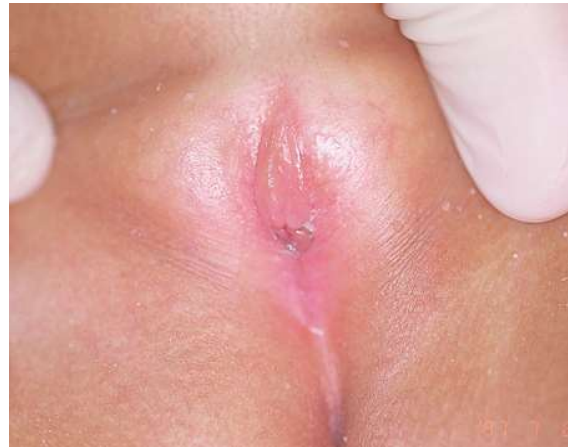
Fig. 3. Complete adhesion of labia giving the appearance of ‘absent external genitalia’.

An 18 month old girl was brought by parents with history of crying during voiding and poor urinary stream for the past few weeks. The child was well before and was otherwise reported to be normal by parents. On examination, complete labial fusion was noted [Fig. 3].