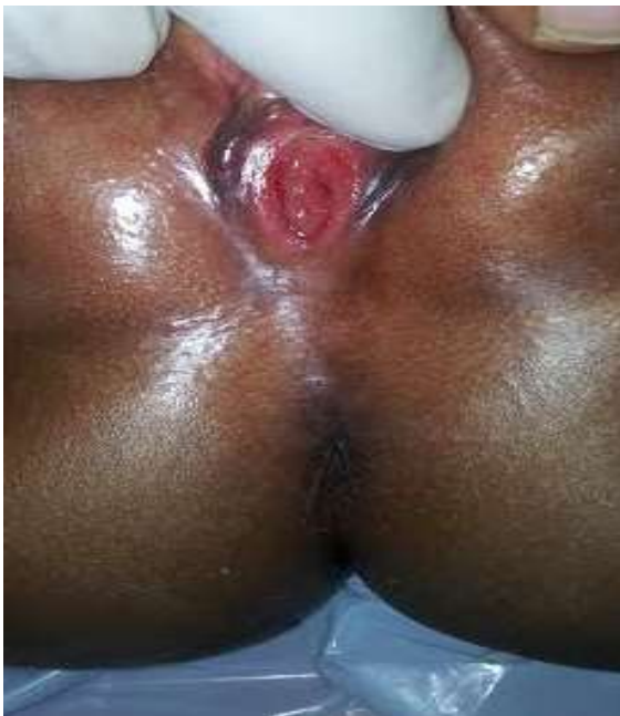
Fig. 2. Post-surgical lysis of labial adhesion.

A simple and gentle lysis was undertaken which resulted in clear visualization of the urethral meatus and the vagina [Fig. 2].