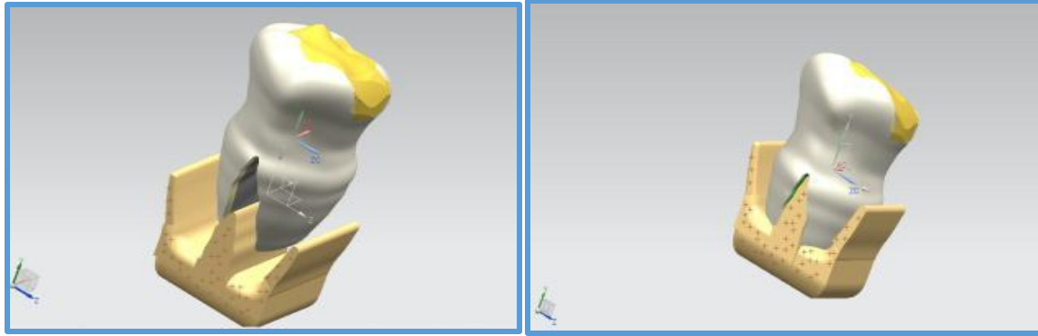
Figure 1: Three-Dimensional Model and Inlay Volume Created