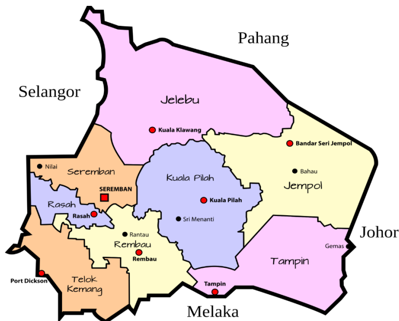
Figure 1: Map of Negeri Sembilan showing Various Districts and towns

Below is a comprehensive map of Negeri Sembilan State where the research work was carried out.