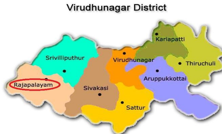
NB: Study Area Marked in Red Color

The study is conducted in the Rajapalayam municipality of virudhunagardistrict, Tamil Nadu. Rajapalayam (is a town and a special grade municipality in Virudhunagar . It is located 85 km southwest of Madurai in the state of Tamil Nadu. Its main attractions are the Ayyanar Falls and the neighbour town of Srivilliputtur. The economy is based on the manufacture of textiles, and there are mills for spinning and weaving cotton, as well as a large cotton market.