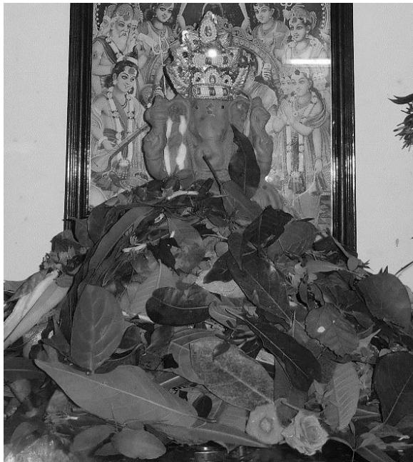
Figure 6: Offering of varieties of leaves to Gaṇapati

Baski or sit-ups: Another interesting coincidental practice to support the current hypothesis is performing sit-ups after the traditional Gaṇapati Pūjā. Compared to several other festivals and pūjās , that are performed, one thing special about the Gaṇapati pūjā is performing ‘ Baski ’, a form of exercise with repeated sit-ups with hands crossed and holding the ears. This exercise is done after Gaṇapati pūjā . This symbolizes that after taking food one should work well to digest the food that is consumed.