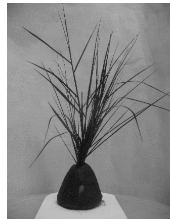
Figure 4: Pillari

Pillari: Added to the above coincidences is the Pillari which further supports the hypothesis that Gaṇapati is lord of food. The Pillari is said to be the true original or root form of Gaṇapati. During the Gaṇapati festival on Bādrapada cauti (4 th day from the new moon day), before doing pūjā for the elephant faced form of Gaṇapati, the ' Pillari ' is first offered the pūjā . Pillari is basically cow dung in the shape of a cone with a little grass pierced into the apex of the cone. Grass indicates the vegetation, which is the source of food. Grass family is the family of vegetation where we get the basic/staple food,