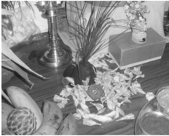
Figure 5: First pūjā for Pillari

the rice, ragi, jowar, wheat etc. Cow dung being one of the best manures on earth, the grass comes out of the manure, which is what is indicated in Pillari . Fig. 4 show Pillari .