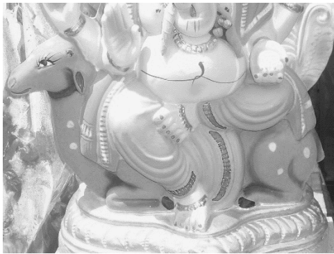
Figure 3: Gaṇapati – Riding on the rat.

Rat as vehicle: Rats are notorious, especially for the farmers. They are like pests in the fields and spoil, eat and contaminate the crops, fruits, vegetables, cereals, oilseeds or whatsoever. Hence control over the rats is important to avoid spoiling of food. Hence, Gaṇapati rides over the rate, with a whip symbolizing its control. The snake around the stomach also have the role of keeping rats under control. Fig. 3 shows Gaṇapati being seated on a rat.