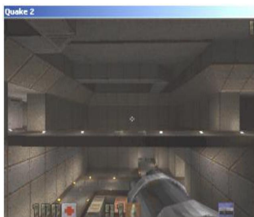
Figure 5: Agent- at the dead end