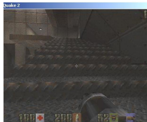
Figure 4: Agent- climbing the stairs