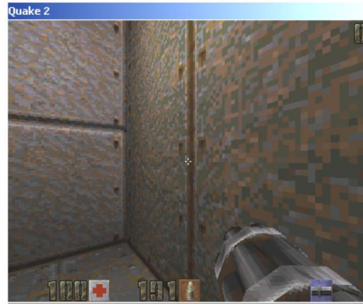
Figure 2: Agent wall following