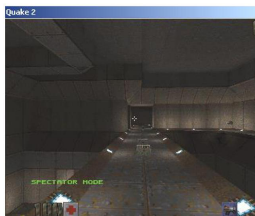
Figure 6: Agent- environment scan