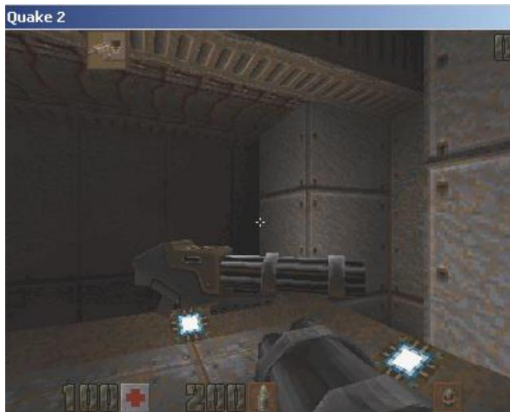
Figure 3: Agent selecting the weapon