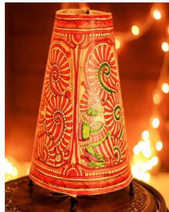
Figure 5: A Contemporary Mithila paintings on textile and lamp shade (functional and utility products)

Also, prey to cyclic development and fast changing market demand. Majority of the Mithila Madhubani painting artists find it extremely difficult to consider painting as their primary source of livelihood due to prevailing uncertain market. There are not able to earn even minimum daily