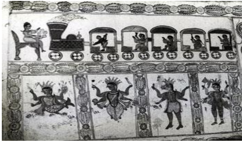
Figure 1: A traditional Mithila painting on wall depicting religious theme (God and goddess)

region of Bihar state, India, and the adjoining parts of Terai in Nepal are characterized by line drawings based on mythological themes, in bright colours and decorative borders. They are so called because they originated in and around a large agricultural town in Bihar, Madhubani or 'Forest of Honey'. Originally, Mithila Paintings were executed on freshly plastered mud walls, on religious occasions or weddings. Each painting was a prayer and an accompaniment to meditation. Well executed paintings were believed to be inhabited by the deities depicted in them. The colours used in these paintings were made from natural dyes. The tradition of Mithila painting of Bihar has continued unbroken to the present day and has yet evolved with the times and changing more. These paintings are practiced by the women folk, which is an exclusively feminine school of folk painting. Mithila paintings are practiced till date in the village of Jitwarpur, Ranti, Rasidpur, Bacchi, Rajangarh, etc. This art is said to date back to the times of the Ramayana when it is believed Janaka who ruled.