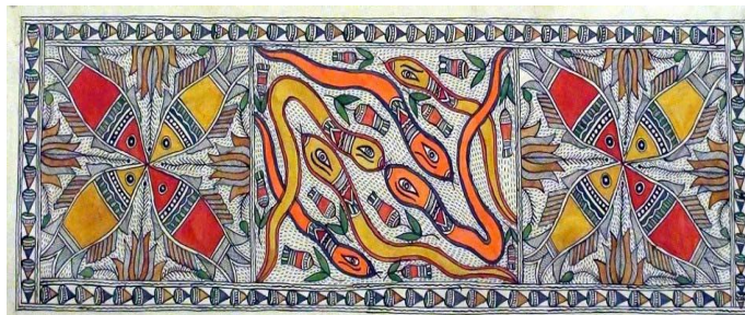
Figure 2: A Contemporary Mithila paintings depicting symbolic themes

Originally, Mithila Paintings were executed on freshly plastered mud walls, on religious occasions or weddings. Each painting was a prayer and an accompaniment to meditation. Well executed paintings were believed to be inhabited by the deities depicted in them. The colours used in these paintings were made from natural dyes. The tradition of Mithila painting of Bihar has continued unbroken to the present day and has yet evolved with the times and changing more. These paintings are practiced by the women folk, which is an exclusively feminine school of folk painting. Mithila paintings are practiced till date in the village of Jitwarpur, Ranti, Rasidpur, Bacchi, Rajangarh, etc. This art is said to date back to the times of the Ramayana when it is believed Janaka who ruled Mithila, commissioned artist make painting on his daughter Sita to Rama.