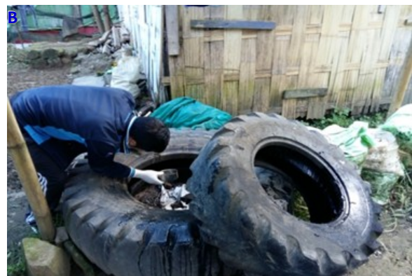
Figure 1 | Vector-mosquito control. A. Space spray/fogging; B. Source reduction.