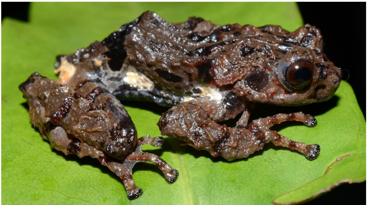
Fig. 1 | Dorsal, ventral and lateral aspects of Theلودerma moloch (PUCZM/IX/SL 371; 36.6 mm SVL) from Mizoram, northeast India.