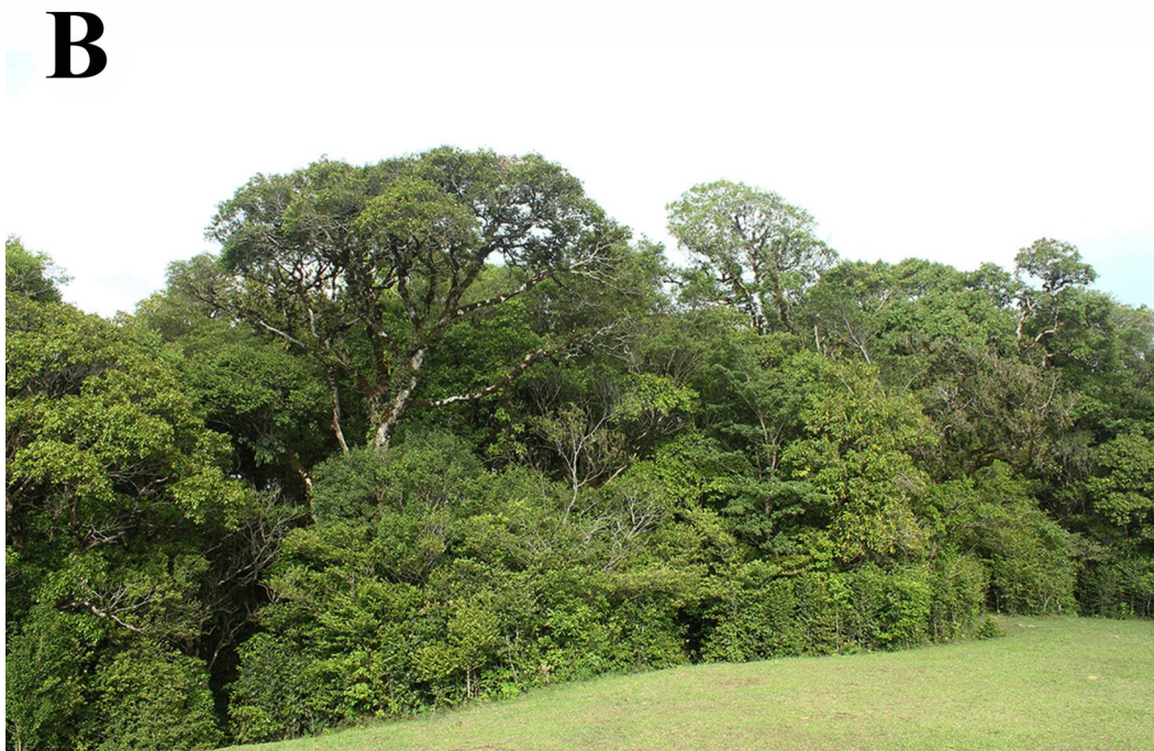
Fig. 3 | A. In-situ photo of male Theioderma moloch (PUCZM/IX/SL 328; 39.8 mm SVL) on tree trunk; B. Habitat of T. moloch at Hmuifang Community forest, Mizoram, India.