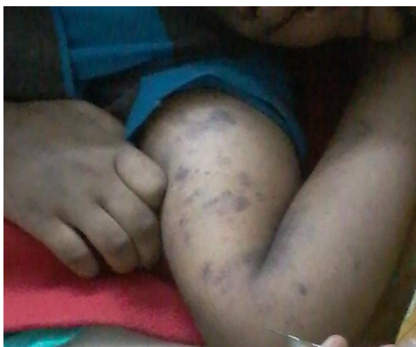
Fig.No.1 petechiae on the patient skin

previous treatment regimen hydrocortisone 100mg through IV was given. On the eighth day patient was with facial puffiness, nasal blockage and haematuria. Complete blood picture showing that Hb- 5g/dl, TLC- 2,500 cells/cumm, Neutrophils-30%, Lymphocytes- 65%, Eosiniphils- 3%, Monocytes- 2%, platelet count- 60,000, ESR- 98 mm/hr. In addition to the daily treatment regimen chymoral forte tablet OD was given. On the ninth day also patient was with similar complaints, same treatment regimen was continued. Blood transfusion was done. On the 10 th day patient had similar complaints and on the same treatment regimen there is no improvement of patient condition, on the 11 th day patient was died due to febrile neutropenia. Eser et al mentioned in his study during the course of the aplastic anemia infection followed by neutopenia leads death [3].