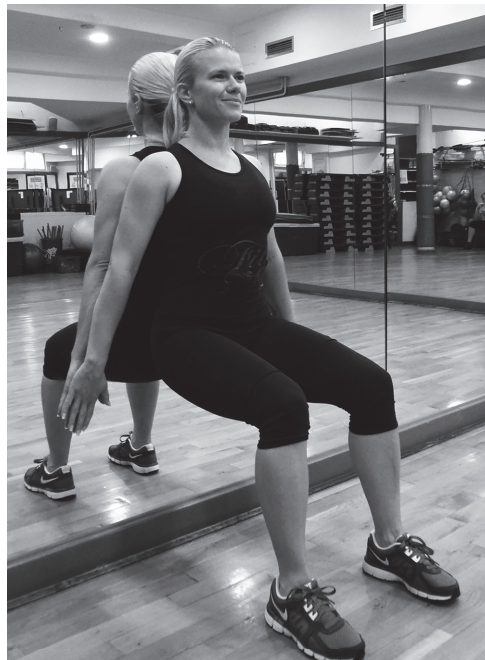
Figure 3. Wall squat hold test

hands extended beside the body in abdomen height. Exercise was performed until exhaustion, as long as possible. Static strength of abdomen was measured with this test.