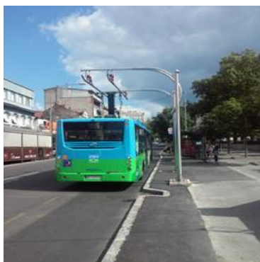
Figure 7 Charging station "Vukov spomenik"