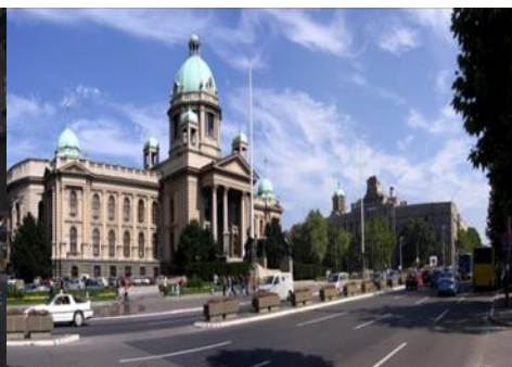
Figure 2 National Assembly