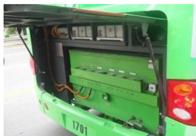
Figure 6 Position of supercapacitors