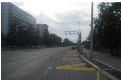
Figure 5 Charging station "Belvile"