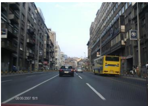
Figure 1 Brankova street