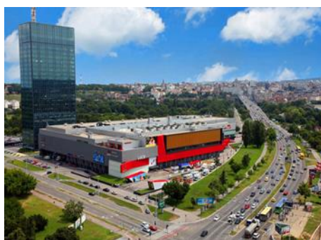
Figure 3 Shopping malle "Usce"

Line 1E is planned as a diametrical line that would connect Vukov monument, over the Nikola Pasic Square, Branko's Bridge to the New Belgrade (Figure 4). This line would provide the missing direct connection with New Belgrade on the Nikola Pasic Square and King Alexander Boulevard. The route located along of many tourist attractions (National Assembly , St. Mark's Church ...), administrative center of Belgrade, Faculty of Law, Faculty of Engineering, Shopping Malls "Usce" and "Delta City", Kombank arena, Railway station "Novi Beograd ".