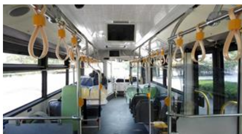
Figure 10 Interior of the E-bus Higer