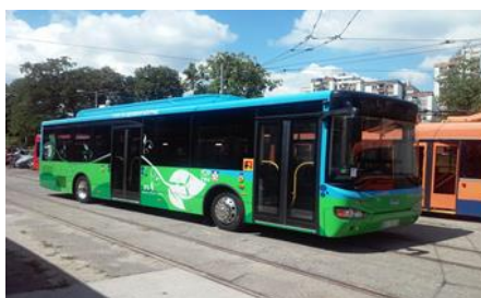
Figure 9 E-bus Higer KLQ6125GEV3