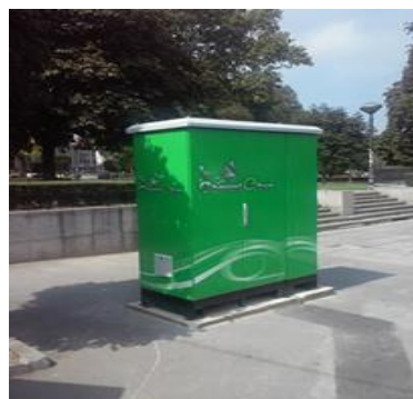
Figure 8 Charger