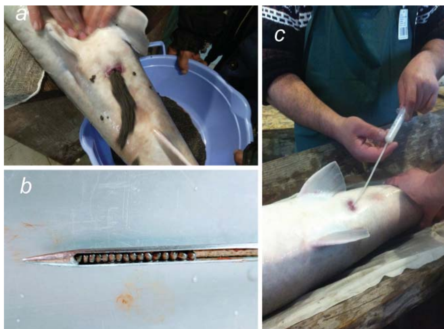
Fig. 1. Sampling of sex products from sturgeon fish: female ( a ) and male ( c ); proof stick with withdrawn mature sterlet oocytes ( b )

In the process of eggs incubation, the observations on synchronicity and compliance