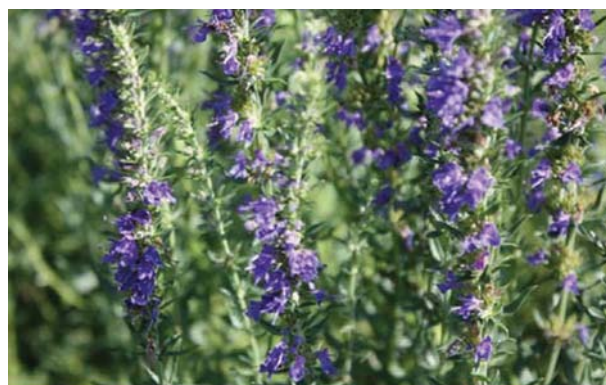
Fig. 1. The blooming stage of H. officinalis , grown in Botanical Gardens of Zhytomyr National Agroecological University

The study was based on Hyssopus officinalis L. cv. Markiz with dark blue and violet corolla (Fig. 1).