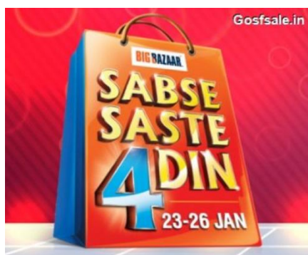
Figure 5: Big Bazaar Sale Offer

Similarly all Ecommerce websites like Amazon Now, Flipkart, Big Basket offer various schemes to attract consumers. Whether these schemes make economic sense or not, the schemes can be quite disruptive for low cost models like MGP distribution model. There are other household items that require periodic purchases like clothes, bed sheets, pillow covers, disinfectants, soaps and toiletries, fresh produce, fruits and vegetables, wet groceries, etc., which is not available at MGP as a result of which the consumer has to use other available options. At these times, the consumers also end up buying the products offered by MGP elsewhere.