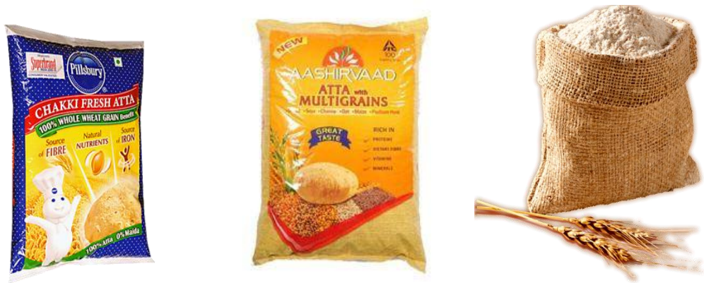
Figure 6: Branded and Unbranded Wheat Flour

Pillsbury wheat Chakki fresh atta or ITC's Ashirvaad Multigrain atta have to comply with FSSAI rules and regulations. However, "loose" items, an euphemism for locally processed items escape these stringent quality control. Processed items available at MGP like Lokwan Wheat Flour, Sihor Wheat Flour, Besan etc., are without any such certificates. Although every attempt is made by MGP to have proper quality control the systems are more experiential than scientific, more traditional than rational and generally based on consumer feedback. The local kirana stores also offer these "loose" items, which come without FSSAI certificate but have the seller's "guarantee" of good quality!! The current middle class, upper middle class and the millennial are very brand, health and quality conscious and this category of consumers may not be keen on MGP product offerings due to perceived quality issues.