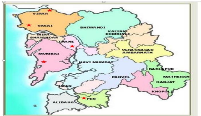
Figure 3: MGP Distribution Centres in Mumbai Metropolitan Region

each being located in Vile Parle (W), Thane, Vasai, Palghar, and in Pen. Each of these centre cater to the consumers residing in the geographical areas closest to service. The process of distribution and collection of requisition and payments remains the same. Every month on an average around 94 grocery items are offered to the member consumers. About 20% of the high consumption items like wheat, wheat flour are repeated every month but less consumed items like pulses, toiletries, personal care products are repeated after two or three months. Members fill in their requisitions and make the computations of their monthly item wise bills, as the approximate prices for each item is clearly mentioned in the requisition.