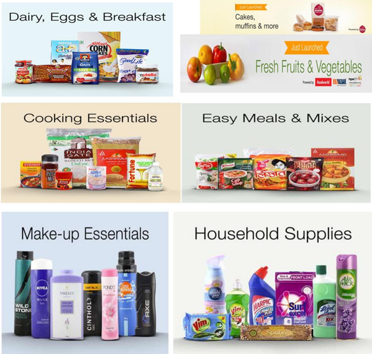
Figure 4: Cross-section of Products being offered by Amazon Now on their App

Likewise Big basket also offers over 18000 items on its website under various product categories, exclusively falling under the household grocery items list and offering many choices in each category. The major difference between the MGP model and those followed by Amazon Now, FlipKart, Big basket is