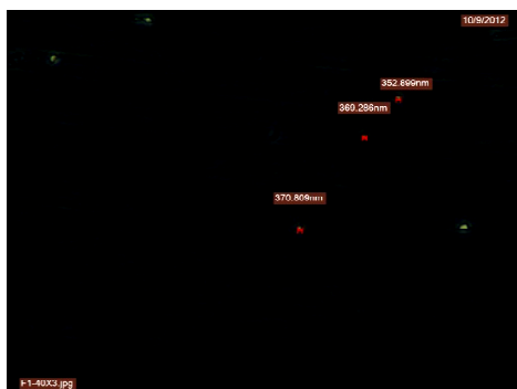
Wrightia arborea Phytosome WAP (40 x)