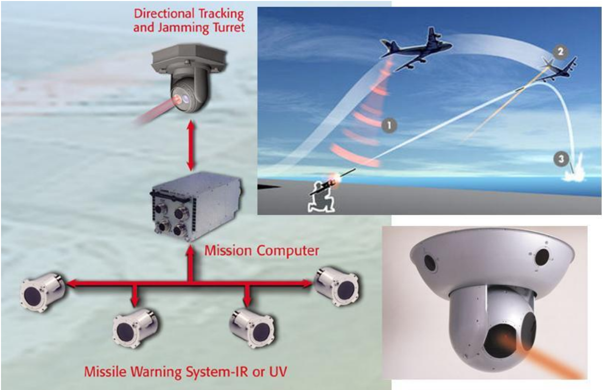
Fig.3. Rafael Britening system: 1) detection of attack, 2) rocket jamming [11]

The means to mislead enemy missiles have long been known in military aviation. These mainly include on-board or suspended pods, which emit energy to jamming systems, as well as rocket flares and chaffs (aluminium strips). They are used to jam homing infrared systems (flares) and radar systems (aluminium strips) of flying missiles. The civilian aviation community is also interested in such devices.