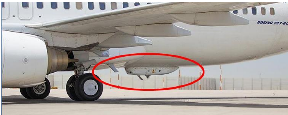
Fig. 4. C-MUSIC system on a Boeing 737-800 belonging to El Al

Rafael's Britening system has sensors for the detection of incoming missiles, which are triggered by changes in heat in the environment. If this occurs, the Britening system generates a powerful beam of light, which interferes with the guiding system of the missiles [8, 9, 14, 15]. It can protect against light-guided missiles, especially during take-off and landing, while the system works automatically. The Britening system is based on the Aero-Gem protection system for military helicopters, with costs of around two million US dollars. Another similar system is the Israeli IAI/Elta Flight Guard, which working in a similar way to the Britening system except that it detects missiles using Doppler radar. IAI says that the Flight Guard offers 99% efficiency and is able to operate in any weather conditions. The system weighs 60 kg, with dimensions of 306 x 361 x 207 mm, and consumes 500 W of energy [11].