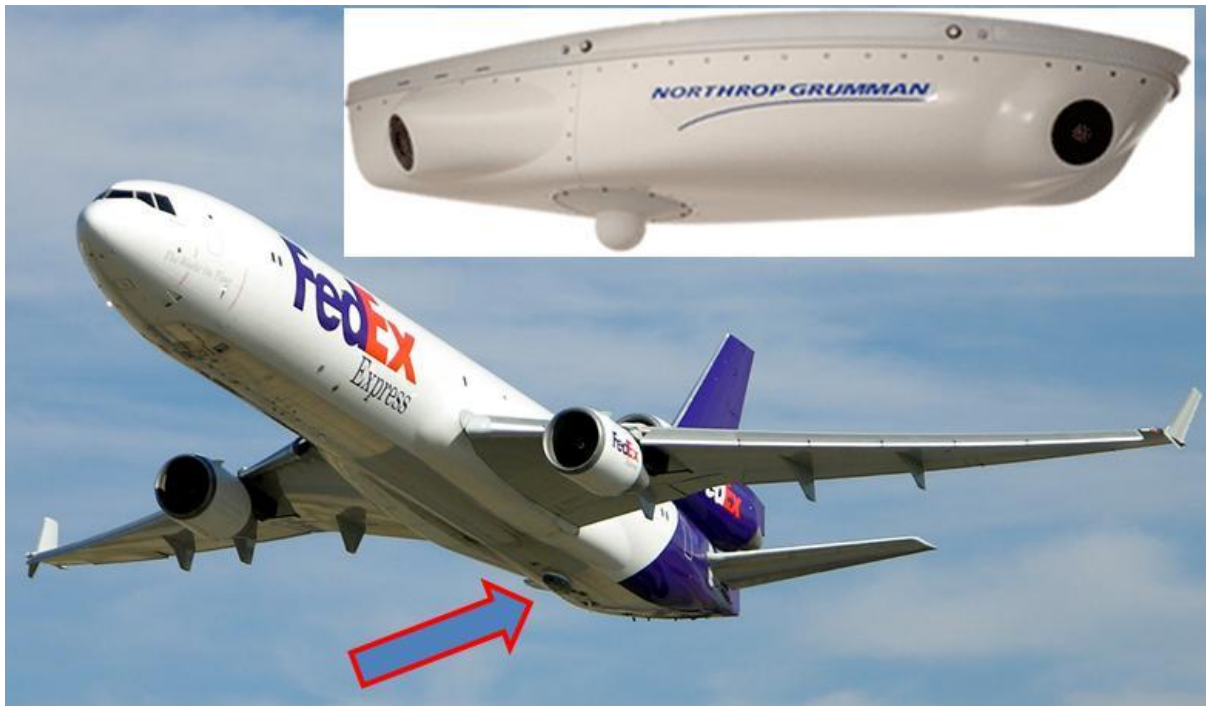
Fig. 5. Northrop Grumman Guardian on a FedEx MD-11 [13]

Another country that develops on-board anti-missile systems for civil aircraft is the USA. On 21 December 2008, the US Department of Defense signed a contract with BAE Systems for this type of equipment. Under this contract, anti-missile systems were to be installed on aircraft belonging to American Airlines flying between New York and California [8]. The similar Guardian system has been developed by Northrop Grumman, which is civilian variant of the AN/AAQ-24 (V) Nemesis military system. Guardian can be placed almost anywhere on the fuselage and increases fuel consumption by only 3-4% [8].