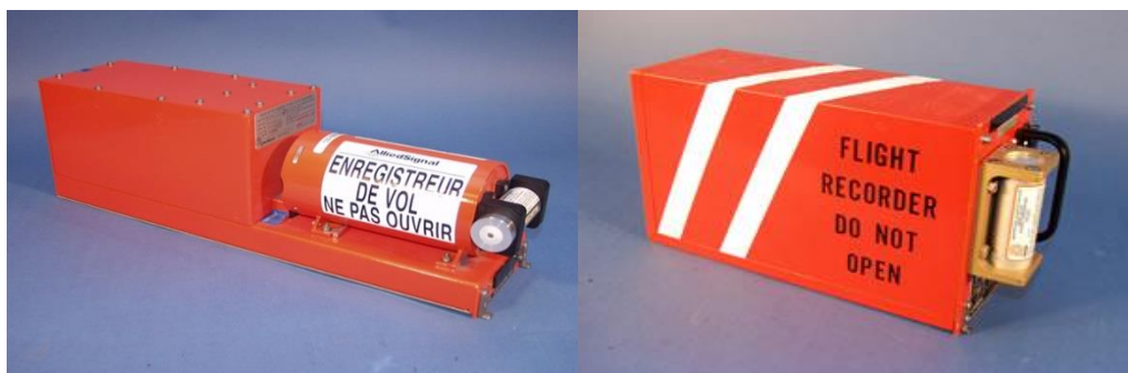
Fig. 4. Overview of different flight data recorders

Other devices that are not typical recorders, such as GPS devices, handheld video cameras, mobile phones, laptops, industrial video cameras and photo cameras, can also provide information about the flight course.