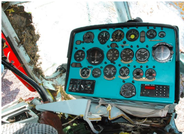
Fig. 2. View of a helicopter instrument board with recorded positions of indicators and switches

As for the elements of the aircraft, both the appearance of the elements and their spatial location in the area should be examined. When there are doubts about the name of a given element, its function and completeness, members of the PKBWL (if present at the aviation accident scene) may be asked for help, or the identified element may remain without a name, but with its appearance recorded.