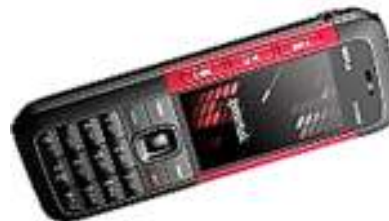
Fig. 16. Showing Nokia's phone- XpressMusic in 2006

The precursor to the 5800, the Nokia 5310 XpressMusic launched in 2006. Sales reached 10 million for the handset, which had a GPRS (General Packet Radio Service) internet uplink