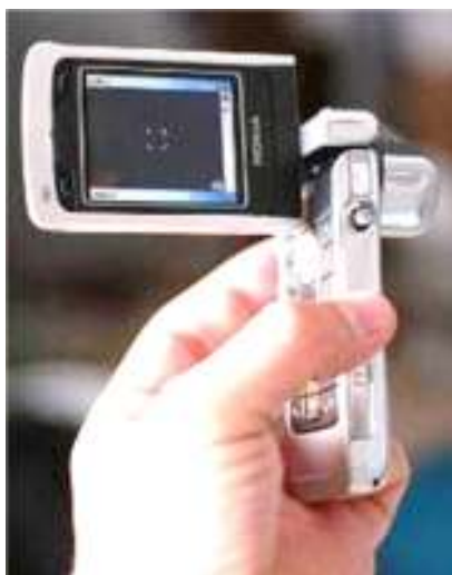
Fig. 15. Showing Nokia's phone-cum-video camera

This phone-cum-video camera was Nokia's first smartphone. Ahead of its time when released in 2005, the phone supported wireless, 3G and multimedia including video, music and internet. It was released alongside the N91 and N70, which were also considered smart.