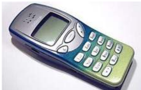
Fig.12. Showing Mobile device from Nokia in 1999

For many adults and teenagers alike, the 3210, which came out in 1999, was their first mobile. Featuring phone calls, SMS and the seminal game Snake, the 3210 helped Nokia top the mobile market, where the company remained for 14 consecutive years. In 2000 it would have set you back around £70. Recently a handset fetched £5,578 on eBay