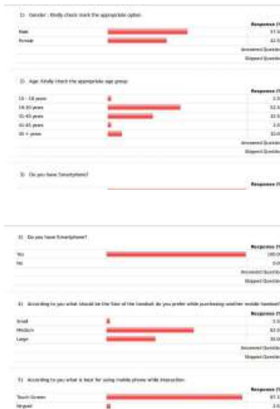
Fig. 26. Showing survey results for New Nokia Mobile Devices

This is the scenario where Nokia has announced re-birth of their most sellable record holder mobile devices and the researcher is analyzing the pre- launch situation of the same. In this study the researcher is willing to know the mindset of the people whether they are ready to welcome once again the iconic legends from Nokia. The Nokia has come up with the upgraded version of the Nokia 3310 with low price than old Nokia, but the price is still to be declared in India, with eye catching color, more memory with expandable memory option and with the best mobile game in the past “Snake”.