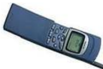
Fig. 11. Showing Mobile device from Nokia in 1996, “8110 - slider

The Nokia 8110, one of the original 'slider' phones, was released in 1996 to great acclaim. Recently, an owner of the retro phone sold one for a massive £2,500 on eBay.