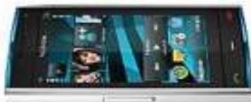
Fig. 20. Showing Nokia's X6- Nokia's flagship music-orientated phone

The X6 became Nokia's flagship music-orientated phone back in 2009. The phone supported social network access and Nokia's Ovi maps. It also came in two different version, one containing an 8GB hard drive and another with a larger 16GB memory.