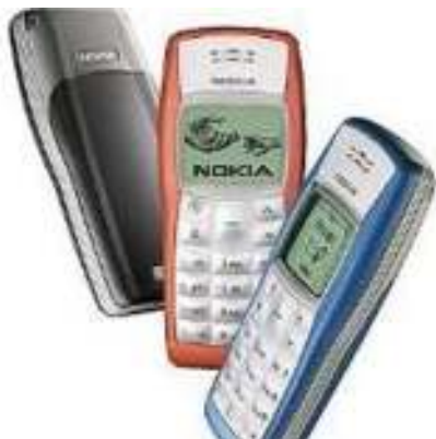
Fig. 14. Showing best seller Mobile device from Nokia in 2003

An incredibly simple and easy to produce handset, the Nokia 1100 remains the biggest-selling mobile phone of all time. With over 250 million units shipped, it's also the world's top-selling consumer electronics product.