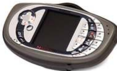
Fig. 18 Showing Nokia's NGage - Series phone in 2007

Nokia has produced some fairly impressive smart phones over the years. The N95 in particular was powerful and cutting edge for the time. It provided a good quality camera as well as many of the features we now take for granted in current iOS and Android powered smartphones.