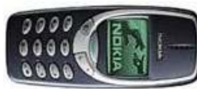
Fig. 13. Showing Mobile device from Nokia in 2000

The 3310 succeeded the incredibly popular 3210 and with it brought improved versions of Nokia's highly addictive mobile phone games. Snake 2, in particular, brought huge popularity to the phone.