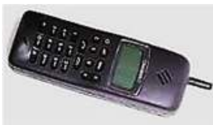
Fig. 9. Showing Mobile device from Nokia in 1992

The Nokia 1011 was its first digital handheld phone for GSM, which in 1987 became the European standard for digital mobile technology. The phone weighed 475g, could store 99 contact details, and could display two lines of black and white text on its screen. Nokia's first phone had an extendible antenna and was introduced the humble text messaging