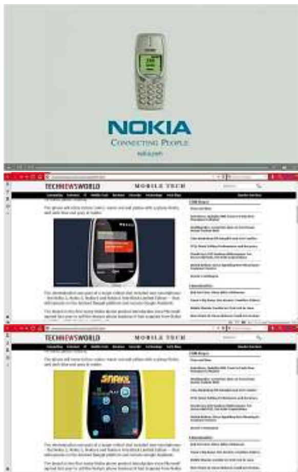
Fig. 24. Showing Nokia's online advertisement and New Nokia Mobile Phone

"This throwback to the year 2000 gets them a lot of media attention, and brings warm and fuzzy feelings," he told TechNewsWorld. "Whether this is going to be anything bigger than that is the problem." [10]