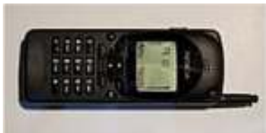
Fig. 10. Showing Mobile device from Nokia in 1994

The Nokia 2110 was the first of the company's mobile phones to carry the signature ringtone, which was later made famous by Dom Joly's Trigger Happy TV antics.