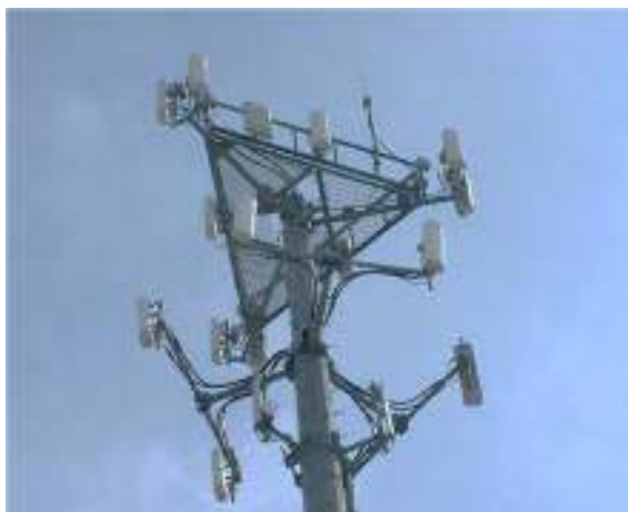
Fig. 2. Showing Telephone Network for 1G

The first generation of cellular networks paved the way to the networks we know and use today. Use of multiple cell tower sites, each connected through a network, allowed users to travel