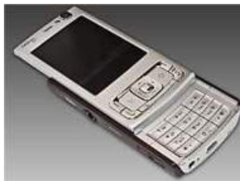
Fig. 17. Showing Nokia's N- Series phone in 2007

Nokia has produced some fairly impressive smart phones over the years. The N95 in particular was powerful and cutting edge for the time. It provided a good quality camera as well as many of the features we now take for granted in current iOS and Android powered smartphones.