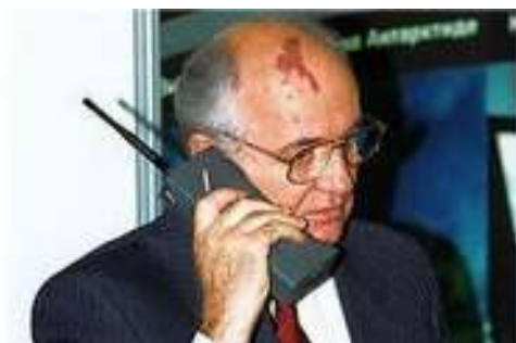
Fig. 8. Showing Telephone “The Mobira Cityman” also known as “Gorba”

Nokia introduced its first handheld mobile phone, the Mobira Cityman, weighing 1.7 pounds. The phone earned the nickname the 'Gorba' after Soviet leader Mikhail Gorbachev is pictured using the phone.