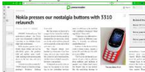
Fig. 23. Showing Nokia's 3310 – re- birth in 2017

Will the rebooted Nokia 3310 be a hit? Difficult to say, but as far as hype generation goes, the venerable phone is currently riding the crest of a wave of nostalgia. Surprising, perhaps, but not entirely unexpected, given the boom in retro tech products over the past few years.