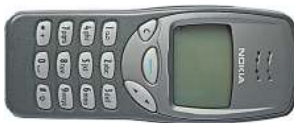
Fig. 3. Showing 2G Enable Mobile Device

As technological advancement picked up the pace, so did mobile phones. The 1990s saw the arrival of two new, digital technologies – the European GSM standard and the North American CDMA standard. Demand grew and more and more cell tower sites were built. In addition to technological improvements in batteries and internal components, this allowed for much smaller mobile devices.