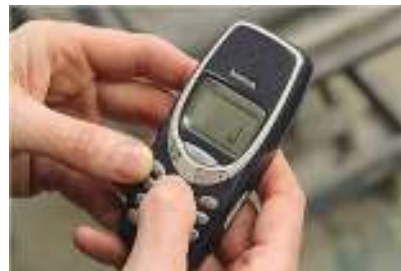
Fig. 22. Showing Nokia's old Nokia from the past