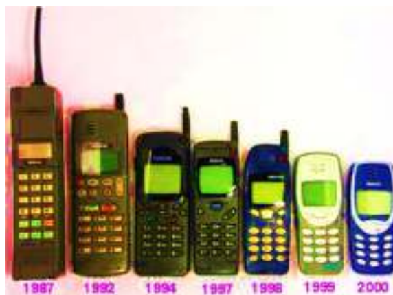
Fig. 6. Showing Nokia’s Mobile Devices from 1987 - 2000