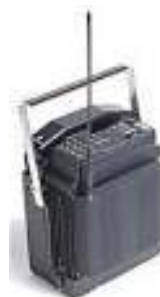
Fig. 7. Showing Telephone “The Mobira Senator”

The Mobira Senator was released in 1982 and is seen as one of the first true mobile phones. Nokia's telecommunications branch originally existed as a merger between themselves and Salora OY. The two companies released handsets under the name Mobira. It was not until 1989 that Nokia began manufacturing phones under its own name.