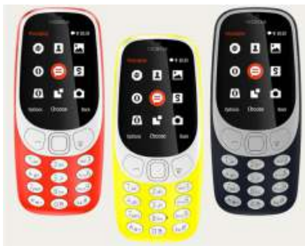
Fig. 25. Showing New Nokia - 3310

Re-birth of Nokia’s iconic best seller mobile devices from the past to the year 2017, this is a great step after a long decade. There was a time that the Nokia was everywhere and the company expanded its market like anything many acquisition has been done earlier to capture the market, with the effect of technological up gradation the company could not cope up with the pace and the other emerging players like Samsung got the maximum market share. In the year 2017, the Nokia brand name is re-birth with their unbeatable iconic legends along with smartphones with android version Nokia 6.