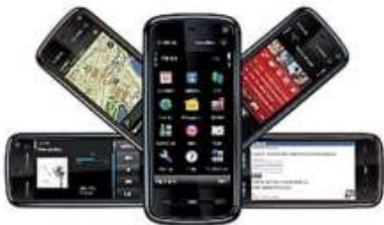
Fig. 19. Showing Nokia's 5800 XpressMusic, Nokia's first touchscreen phone

The 5800 XpressMusic was Nokia's response to the iPhone, released the year before. It sold 13 million handsets and was Nokia's first touchscreen phone.