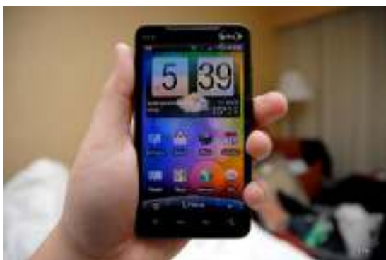
Fig. 5. Showing 4G Enable Mobile Device

While no official standards exist for 4G, a few technologies have laid claim to the title. The first was WiMAX, offered by Sprint in the US but perhaps the most successful has been LTE, which is popular also in North America but non-existent in some territories such as Australia. 4G marks the switch to native IP networks, bringing mobile Internet more in-line with wired home Internet connections.