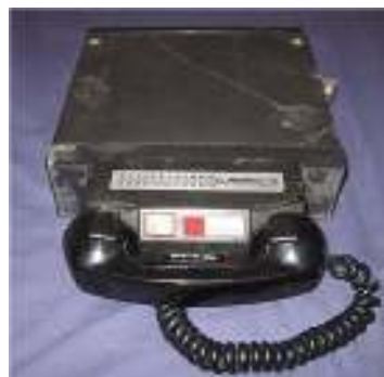
Fig. 1. Showing Telephone of Generation Zero. http://www.technewsworld.com/story/84336.html