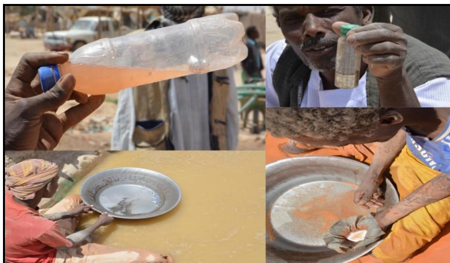
Figure 2. Utilization of Hg in gold extraction processes in the mining area.