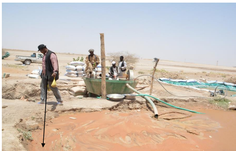
Figure 1. Composite sample represents contaminated soil after extraction of gold.