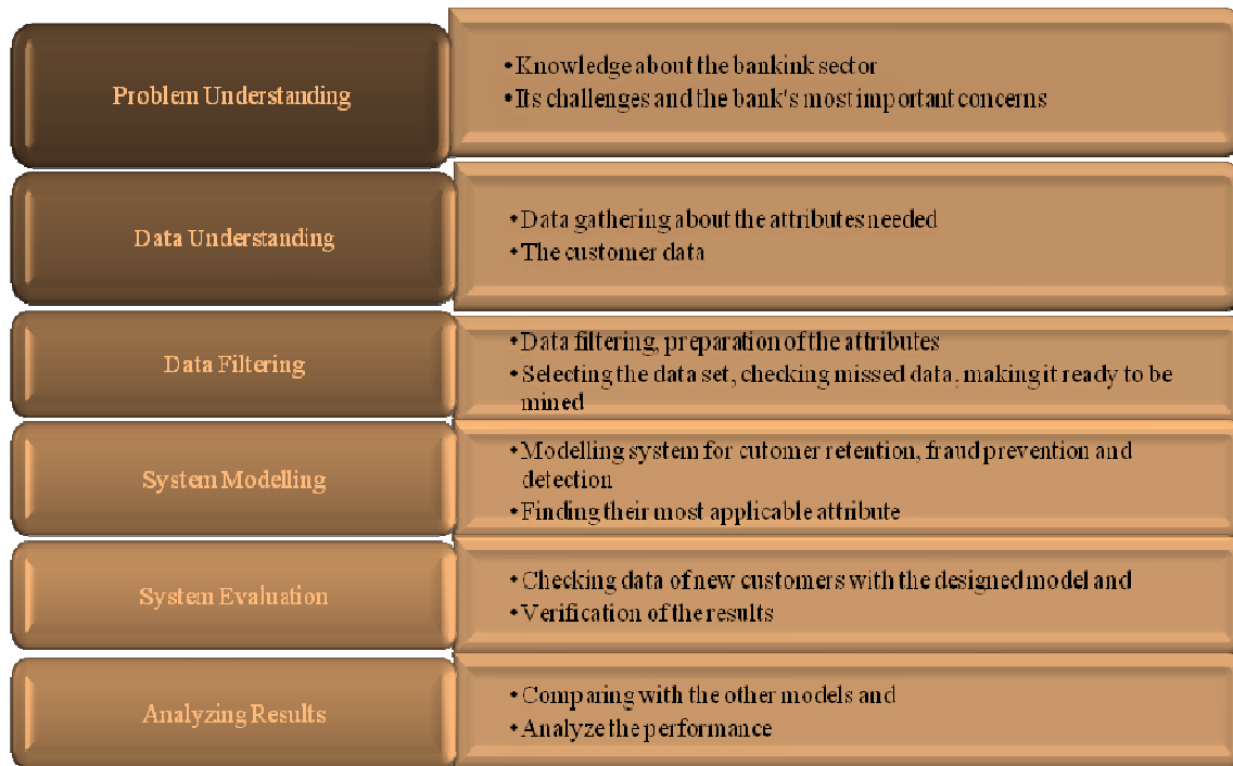
Fig.1: The flow of data mining technique in systemmodel.

information to the user. The following figure 1 illustrates the flow of data mining technique in our systemmodel.