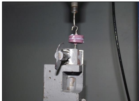
Fig. 4: Testing of samples for bond strength by Universal Testing Machine

using a 980N load cell set at full scale load until separation failure occurred(Fig. 4). The maximum force at which separation failure occurred was divided by the area of adhesion and recorded as adhesive strength. The mode of adhesive failures were classified as occurring at either the adhesive/impression material interface, the impression adhesive/tray material interface, or as a mixed failure occurring at both interfaces.