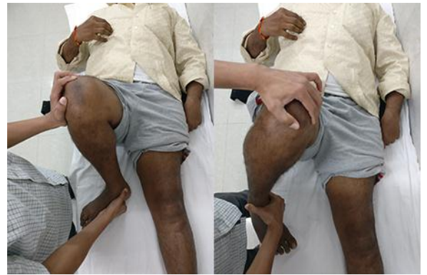
Fig. 3: Clinical demonstration of McMurray's test

No symptoms of meniscal tears were observed in 32 of the 34 cases (Table 1) in their last follow-up which also included 3 cases of meniscal repair done in the white-white zone. Hence, 94% cases were considered as clinically healed. Of the other two cases, one patient had joint line tenderness, and the other had a positive McMurray's test (Fig. 3) during follow-up. None of the patients had any locking episodes. The overall Lysholm score increased to a mean value of 95.2 as compared with the preoperative mean value of 61.5 ( p < 0.0001 ). In 9 cases where isolated meniscal repair was done, the Lysholm score on an average increased to 97% postoperatively from a preoperative score of 65.8% (Table 2). In the 25 cases where ACL reconstruction was combined with meniscal repair, the Lysholm score increased from 60.0% preoperative to 94.5% postoperative (Table 3).