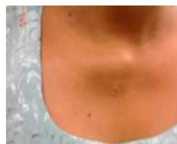
6 weeks of follow up Single scar