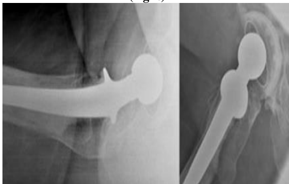
Plate 4: Different anteversion of the acetabular cup in the same patient due to different rotation on a cross table view (left) compared to a lateral view (right)