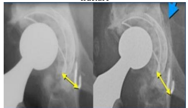
Plate 6: Same case as above with white marks on the tear drop figure. Migration was shown by yellow arrows and blue arrow indicated acetabular fracture