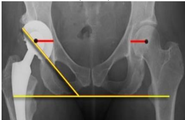
Plate 3: Measurement of lateral acetabular inclination, right lesser trochanter is lower in position than the left indicating leg length discrepancy. Normal horizontal centre of rotation (red line)