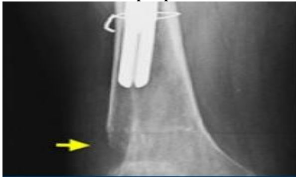
Plate 2: Revision total hip arthroplasty with a large femoral stem with peri-prosthetic fracture