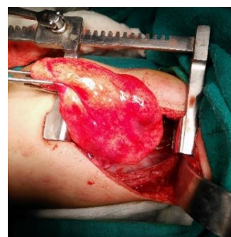
Fig. 3: Intraoperative dissection of CCAM

A three day old male baby weighing 4.2 kg with normal vaginal delivery at home, with no significant antenatal/ perinatal history, presented to pediatric emergency in respiratory distress, respiratory rate varying between 60-70/minute, high grade fever, oxygen saturations ranging between 78-95% and was