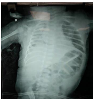
Fig. 1: Chest X RAY-suggestive of loculated radiolucent shadow without pulmonary marking in left middle and lower zone