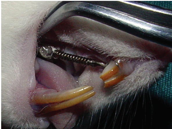
Fig.1: Closed Nickel-Titanium coil spring between first right molar and incisors.