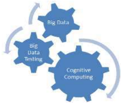
Figure 3. Correlation of Big Data, Big Data testing and Cognitive Computing

The companies that deal with consumers need to come up with improved strategies than they make if they intend on retaining their consumer base. The frequently changing nature of a consumer can't be stopped. Thus, companies need to understand their consumers better.