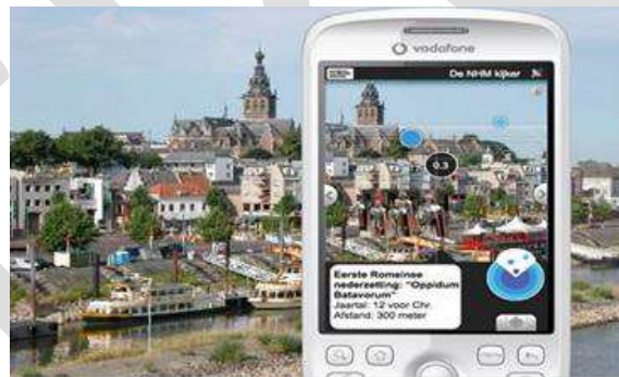
Figure II: Tourism Application [4]

Based on the research was tourism application using AR in 2013 in Ireland. It was the most successful application.