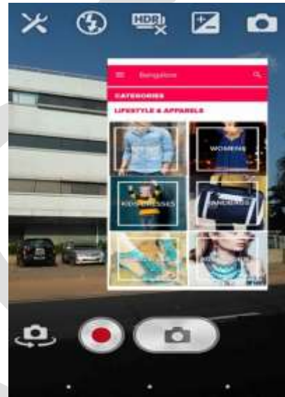
Figure VI: Display details of lifestyle & apparels