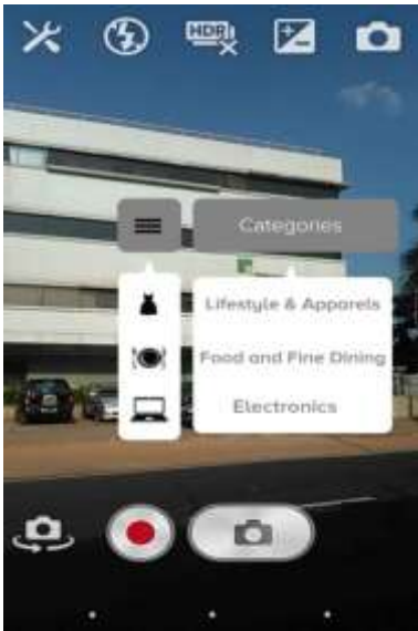
Figure V: Capture Building interface

In this section contains the result of smart shopping using Augmented Reality on Android OS project and what were the new approaches found to address further researches. The project smart shopping using Augmented Reality is developed android mobile application for capture the shop or mall from user own mobile phone. That application was developed by Unity3D software. After user capture the shop or mall that image process through web service and display detail of the shop or mall lively via mobile application. The mobile application selects and recognise the specific area, in which is going to put the digital content.