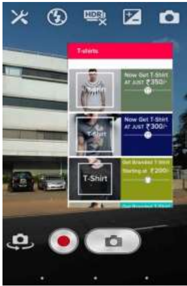
Figure VIII: Display details of cost of products