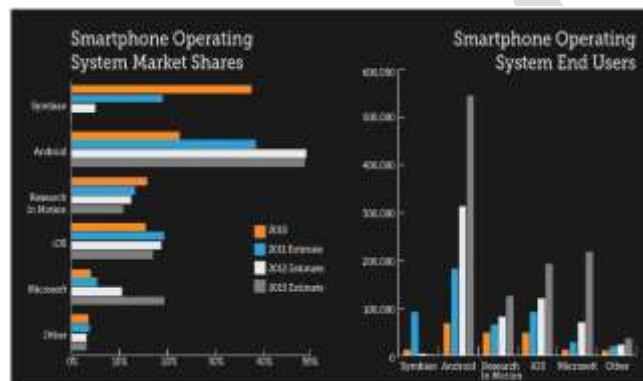
Figure III: Smartphone OS market shares

Among the rapidly growing technologies Android is also stated as one of the most. Due to the advent of 2010 there is increase in stress and has given on the usage of Free and Open Source Software (FOSS). Android is leading the current O.S market as shown in figure III, because it is open source and developed by a consortium of more than 86 leading M.N.C's called Open Handset Allowance (O.H.A). More and more applications have been developed and modified by third party user[7].