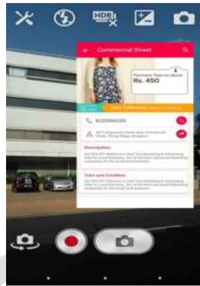
Figure IX: Display details of mall or shop

In this project recognise the specific area like mall or any shops. These recognised area stores in servers. Then server sends the virtual object on top of the malls or shops. When the image and its characteristics are stored in the database, then the mobile application sends the extracted features of the image (captured by video camera) to server using the API.