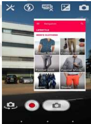
Figure VII: Display details of Men's clothing