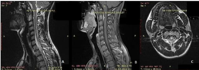
Figure 2: The control cervical MRI showing regression of meningioma in T2 weighted (A), T1 weighted sagittal (B) and axial (C) images

There were no neurological deficits or subjective complaints related to the tumor. Since he had no complaints and didn't want any kind of surgical approach, the meningioma was followed by a control MRI. After three months the control cervical MRI revealed the regression of the meningioma (Figure 2 A,B,C).