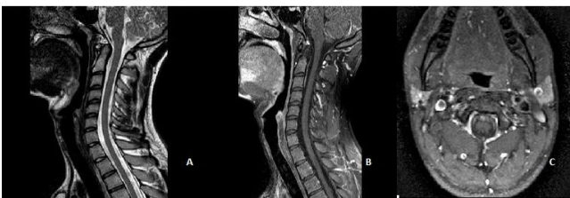
Figure 3: After six months cervical MRI showed complete regression of meningioma in T2 weighted (A), T1 weighted sagittal (B) and axial (C) images with linear contrast enhancement without any solid lesion

The length of the lesion regressed to 35 mm with a sagittal diameter of 6 mm without any signs of hemorrhage and calcification. In his third MRI after six months the lesion was completely regressed (Figure 3A,B,C).