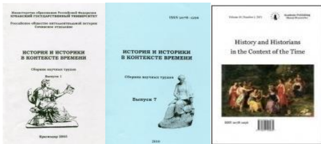
Fig. 1. Appearance of the journal “History and Historians in the Context of the Time” - 2003 and 2010 & 2016. years (Academic Publishing House Researcher, 2016).

development of inter-institutional and international scientific cooperation in the framework of the scientific problems related to the history of the Caucasus (Academic Publishing House Researcher, 2016).