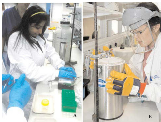
Figure 2. Students learning the intricacies of cryopreservation (A) and vitrification (B) as part of the MSc in Clinical Embryology at the University of Oxford, U.K.

Cryopreservation techniques are under constant scrutiny to reduce potential risks to gametes and embryos. Newer cryoprotectants can replace water in cells during freezing[34], while vitrification has been utilised to replace slow-freezing technologies[35], allowing higher cryoprotectant concentrations within cells and faster freezing to preserve cells in a 'glass-like' state, which avoids the formation of damaging ice crystals[35,36]. Simplified or adapted vitrification protocols have reported even better survival and fertilisation rates compared to original protocols, and there is thus a significant hope for considerable further improvements in the near future[34,37–39].