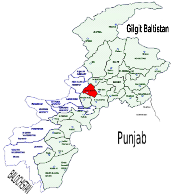
Fig 1: Map of Khyber Pakhtunkhwa Showing District of Charsadda as Study Area.