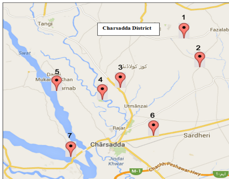
Fig 2: Map of study sites in District of Charsadda (KPK).