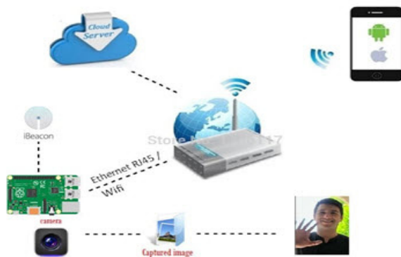
Figure 2. Image and video communication between smart door system and Mobile phone.

The algorithm uses the input images from a camera for communication. The image of home visitor is delivered to the owner of the house via wireless communication. Figure 2 shows the diagram of the video and sound communication system which will be provided between the Raspberry PI and Mobile device. The client may also send voice data to the smart door system to talk to the visitor. Thus, there will be a communication between visitor and client. As a result, client may know the visitor and inform the visitor for her/his current location. On the other hand, the client may call the security if the visitor is unknown. Besides this, obtained images via a camera is stored in the cloud for important issue in the future.