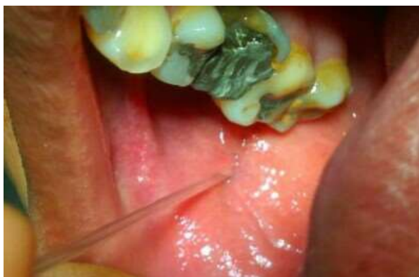
Figure1. Sampling saliva of parotid by laboratory micro hematocrit tube

special paste to prevent the outflow of saliva. This process is repeated for the gland of other side. Each person was assigned a number. The tube containing the saliva of each side was attached on the paper marked in terms of patient's number and their left and right side. The tubes containing saliva can be refrigerated until shipment to the laboratory. Age, sex, dominant side used during chewing and phone conversation, duration of daily calls and use of mobile phone were recorded. To increase the accuracy of recording the dominant side, a chewing gum was given to patient without informing them about the goal, they were asked to chew. All observations and oral examinations were recorded.