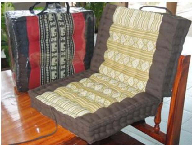
Fig. 2 - A 2-part Khit cushion created by Ban Sri Than weaving group in Yasothon Province