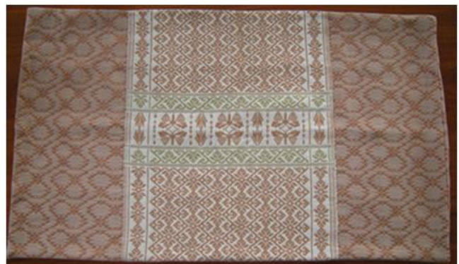
Fig. 5 – A pillowcase with Khit butterfly pattern designed by the research team during the investigation