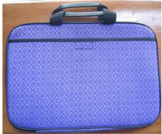
Fig. 3 - A Khit notebook bag created by Ban Kham Phra weaving group in Amnat Charoen Province