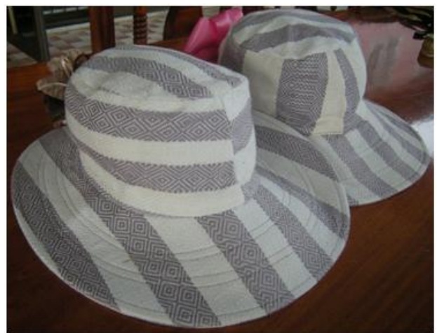
Fig. 4 - A marble Khit hat created by Ban Dan Nuea weaving group in Kalasin Province