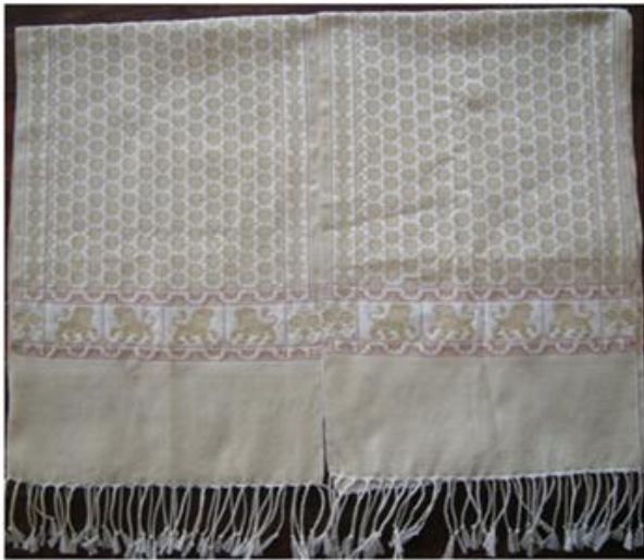
Fig. 6 - A lion-patterned Khit shawl designed by the research team during the investigation