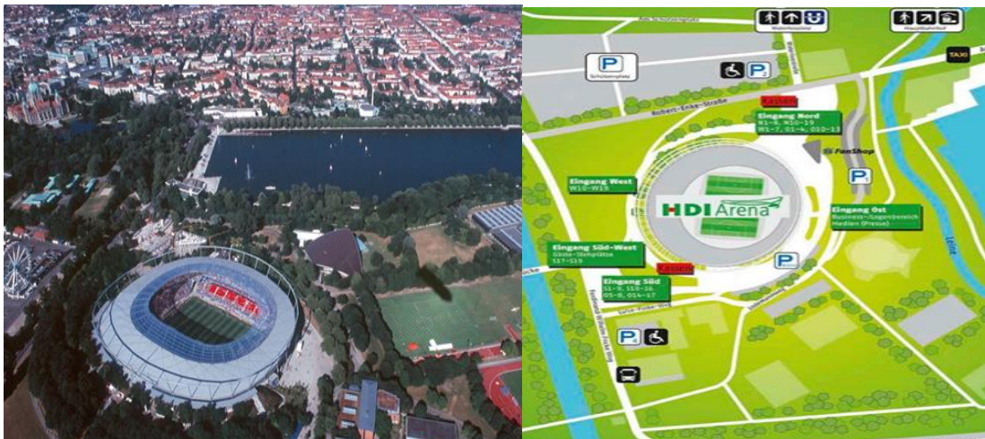
Figure 5. Frankfurt, Commerzbank Arena, Germany