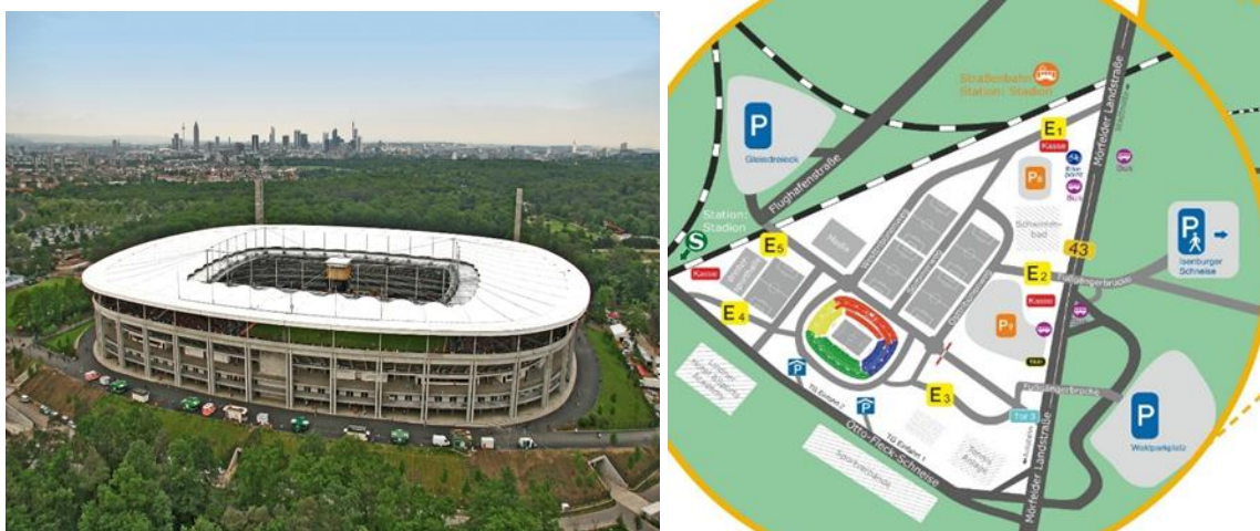
Figure 6. Hanover, AWD-Arena, Germany