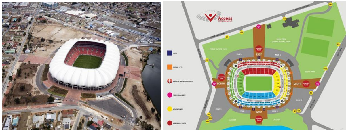
Figure 2. Sao Paulo, Arena Corinthians, Brazil