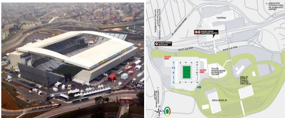
Figure 3. Port Elizabeth, Nelson Mandela Bay Stadium, South Africa