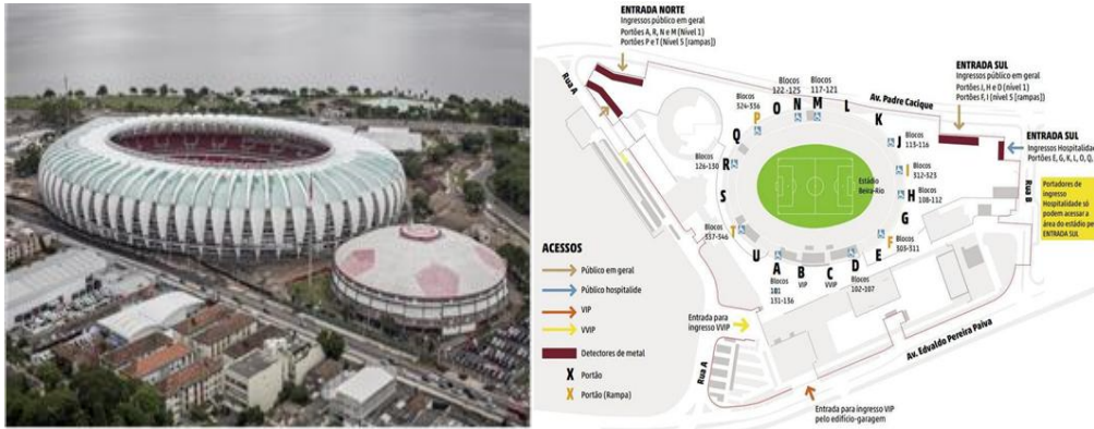
Figure 1. Porto Alegre, Estádio Beira-Rio, Brazil