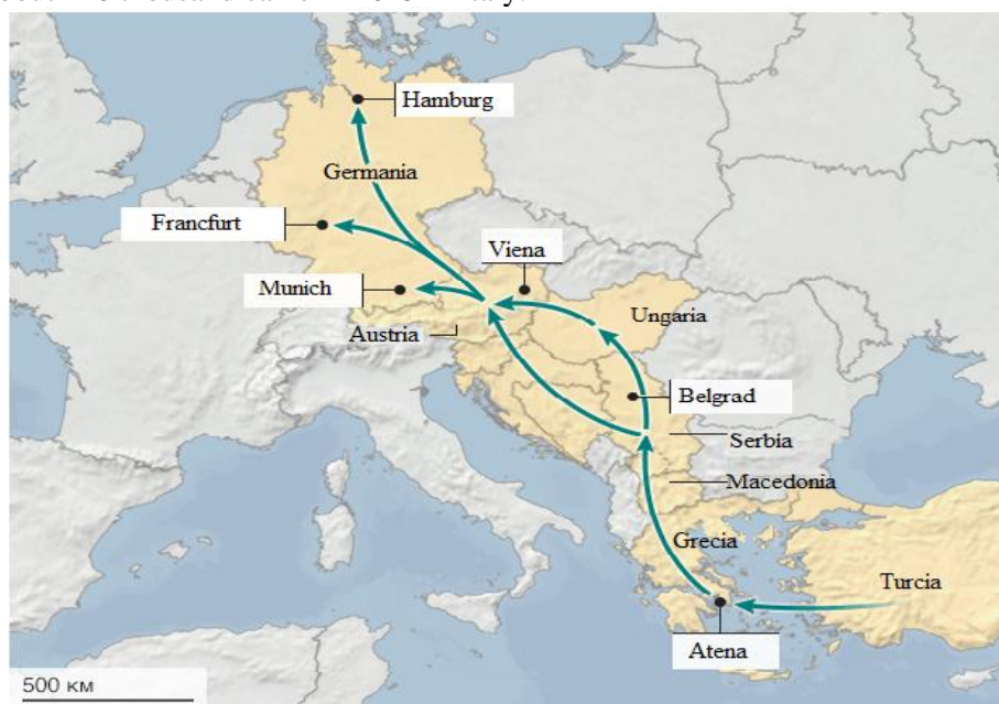
Fig. 1. The path of migration to Germany

Alarming forecasts. Meanwhile, the leader of the Party of Independence of the United Kingdom (UKIP) Nigel Farage, commenting on the European Commission the reduced figure of three million workers, said that nothing could better illustrate the need to exit from the EU and the introduction of a full border control than these alarming forecasts. UKIP claims that by staying in the EU, Britain is powerless to prevent immigration from other EU countries. The European Commission itself indicates that the figure of 3 million is only estimative and this is not an official forecast, including those illegal migrants who have arrived in the EU in 2015. According to the UN, this year in the European Union by sea arrived more than 750 thousand workers, while for the entire 2014 there were 282 thousand. The vast majority of migrants (608 thousand) fell in Greece, which has become a favorite place for the landing of illegal immigrants. About 140 thousand came in 2015 in Italy.