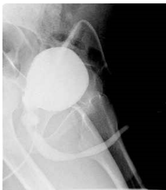
Fig. 3. A post-operative cystogram shows a dilated posterior urethra, but no reflux into the ultrasound and endoscopy identified cystic structure attached to the back of the posterior urethra.

Following an uneventful endoscopic procedure the boy remained catheterized overnight; catheterization that was facilitated by endoscopic insertion of a guidewire and passage of the catheter over the guidewire [10]. The catheter was removed the following day at the time of a radiologic study of the lower urinary tract that showed a dilated posterior urethra, but no reflux into the tubular retro-vesical structure [Fig. 3] that was noted to have emptied on a post-operative ultrasound [Fig. 4 A,B].