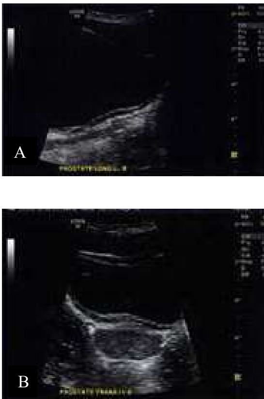
Fig. 4 (A, B). Longitudinal and transverse views of the posterior wall of the bladder after endoscopic incision of the prostatic cyst. The previously noted fluid collection has resolved.