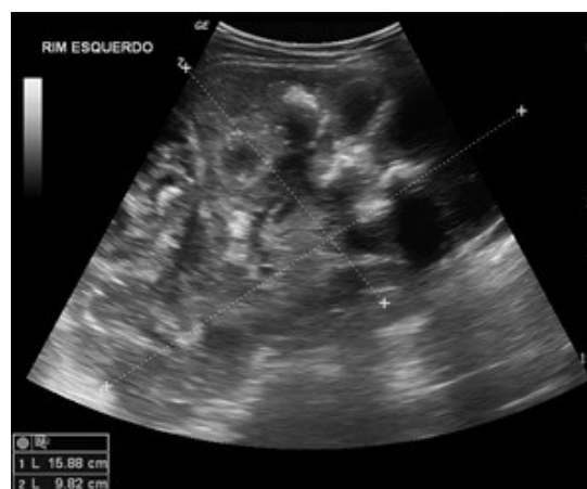
Fig. 1. Abdominal ultrasound – left kidney hydronephrosis, measuring 15,88 x 9,82cm.

In the first semester of 2014 he returned with fever and urinary symptoms, and workup showed calculi and hydronephrosis in left kidney again [Fig. 1,2], this time with renal lithiasis also on right kidney.