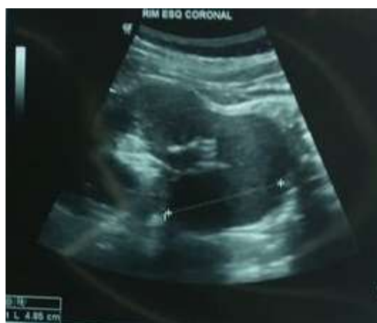
Fig. 2. Ultrasound – multiple cysts suggesting dysplastic multicystic kidney.

Ultrasonography demonstrated various cysts in left kidney with irregular content, suggesting dysplastic multicystic kidney, the largest cyst was in the inferior pole with a diameter of 3,6cm [Fig 2].