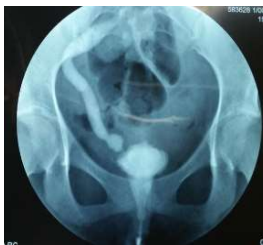
Fig. 1. Renal lump on left side.

hematuria investigation a cystourethrogram revealed grade V vesicoureteral reflux and reduced bladder capacity [Fig. 1].