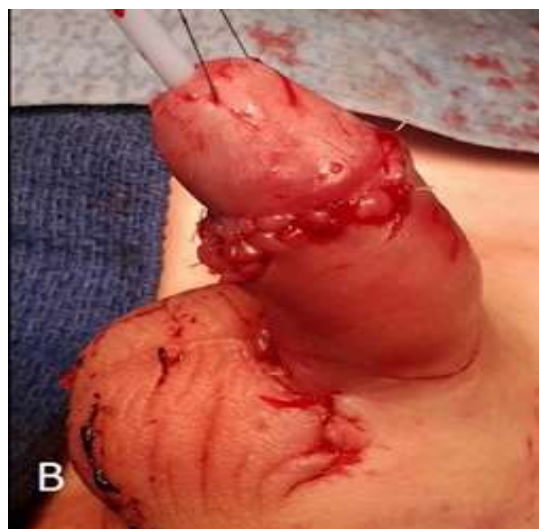
Fig. 3. (A) Skin flaps were used to close the superficial defect covering a raised Dartos flap overlying the repaired pendulous urethra. (B) Re-approximation of the skin at the level of the circumcision.

The patient had an uneventful hospital course, and was observed in the hospital overnight on Vancomycin and Piperacillin/Tazobactam. Rabies prophylaxis was not administered since it was a known newborn, house dog that was previously vaccinated and there were no concerns for Rabies infection. He was discharged home on Amoxicillin/Clavulanate. The Foley catheter and dressing were removed one week post-operatively. With the exception of minor sloughing at the ventral mid-shaft skin, the wound noted to be healing well. At the one month follow-up visit, the parents reported a good stream and no post-operative chordee and at seven-months, his