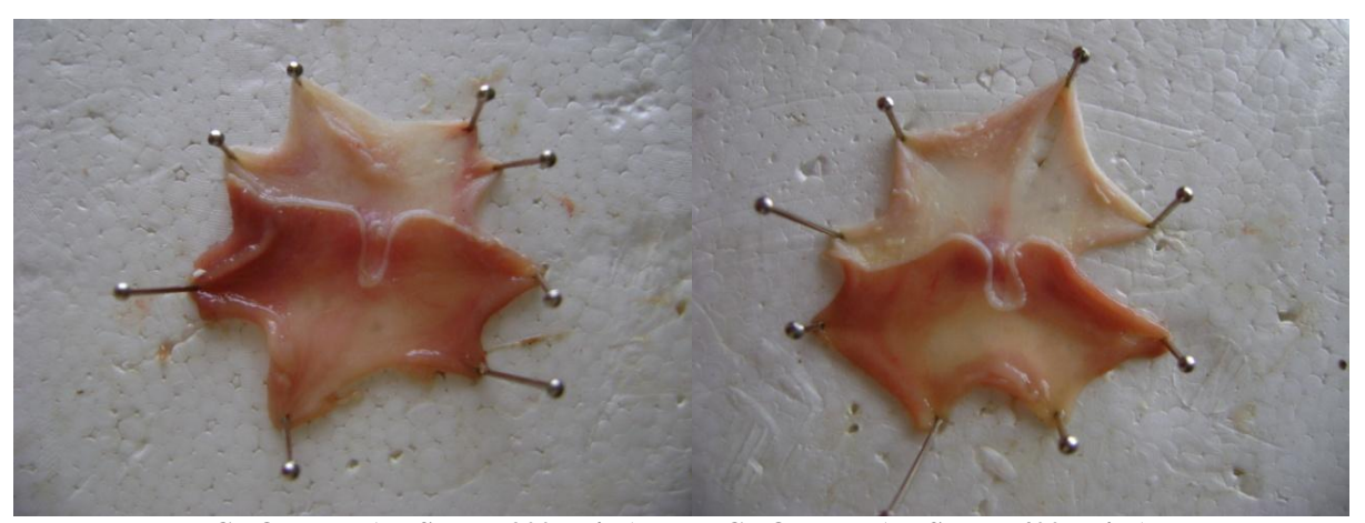
GROUP III (FDSBME 200mg/kg)