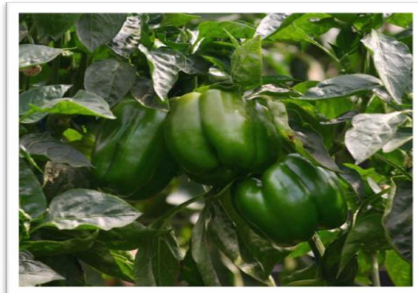
Fig 1: Plant and fruit of Capsicum annum