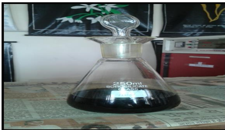
Fig 2: Exaction of Capsicum annum.