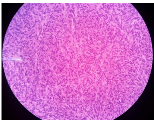
Figure 3: Histopathology of Left ovary suggestive of fibroma

Histopathology report: It showed secretory phase in endometrium, leiomyoma in myometrium, chronic cervicitis in cervix. Left ovary revealed corpus albicans and sheets of well differentiated fibroblast with very scanty fibrocollagenous intervening stroma suggestive of fibroma (Fig. 3)