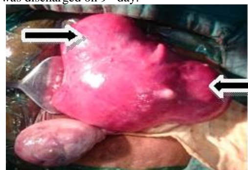
Fig. 1: Uterus with two subserosal fibroids

Total abdominal hysterectomy with bilateral salpingo-oophorectomy was done. On gross examination, uterus was enlarged up to 14 weeks with 2 large subserosal fibroids, each measuring 4cm x 5 cm. Right ovary and fallopian tube were normal. Left tube was normal. Left ovary was enlarged, 5cm x 4 cm, firm to hard in consistency (Fig. 1 and Fig. 2). Specimen was sent for histopathology. Her postoperative period was uneventful, suture removal was done on 8 th day and she was discharged on 9 th day.